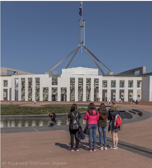
Parliament House, Canberra